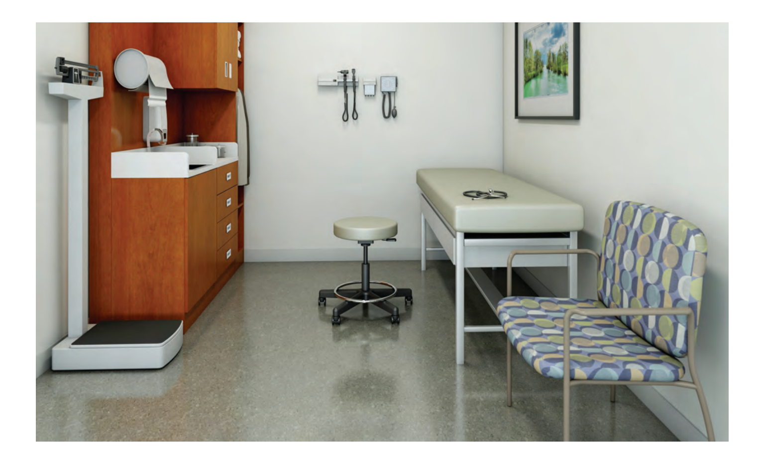
POWER EXAM TABLES